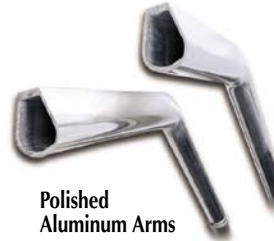
Polished Aluminum Arms